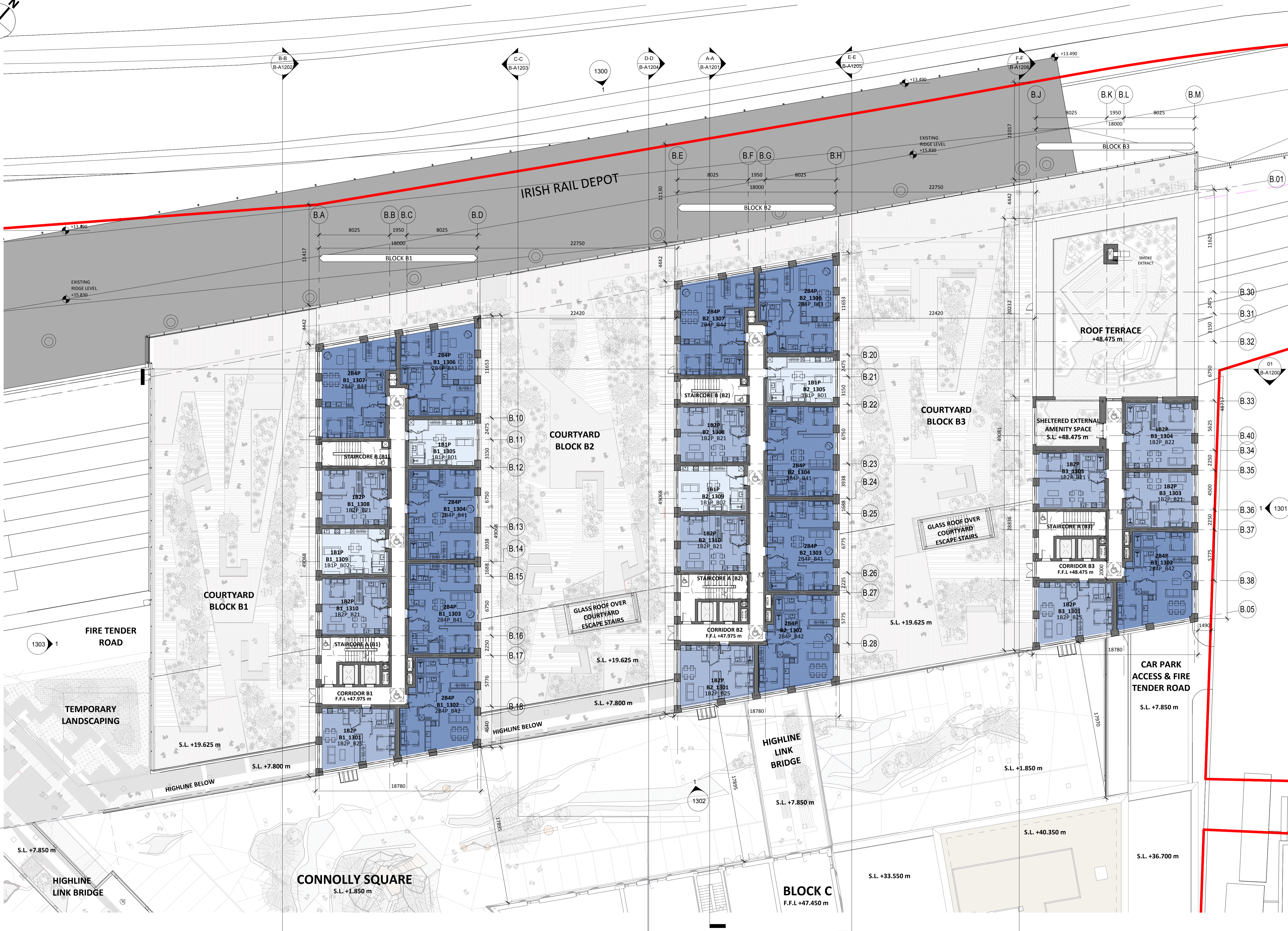
1 BLOCK B PLAN_LEVEL 13 1 : 200